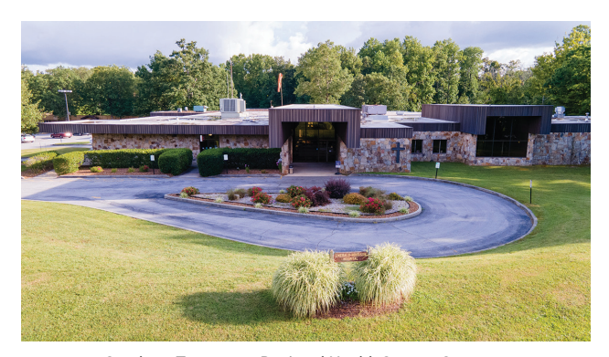
Southern Tennessee Regional Health System Sewanee